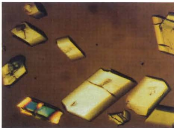
Fig. 1. Batch crystals of penicillin acylase grown from 13% PEG 8K